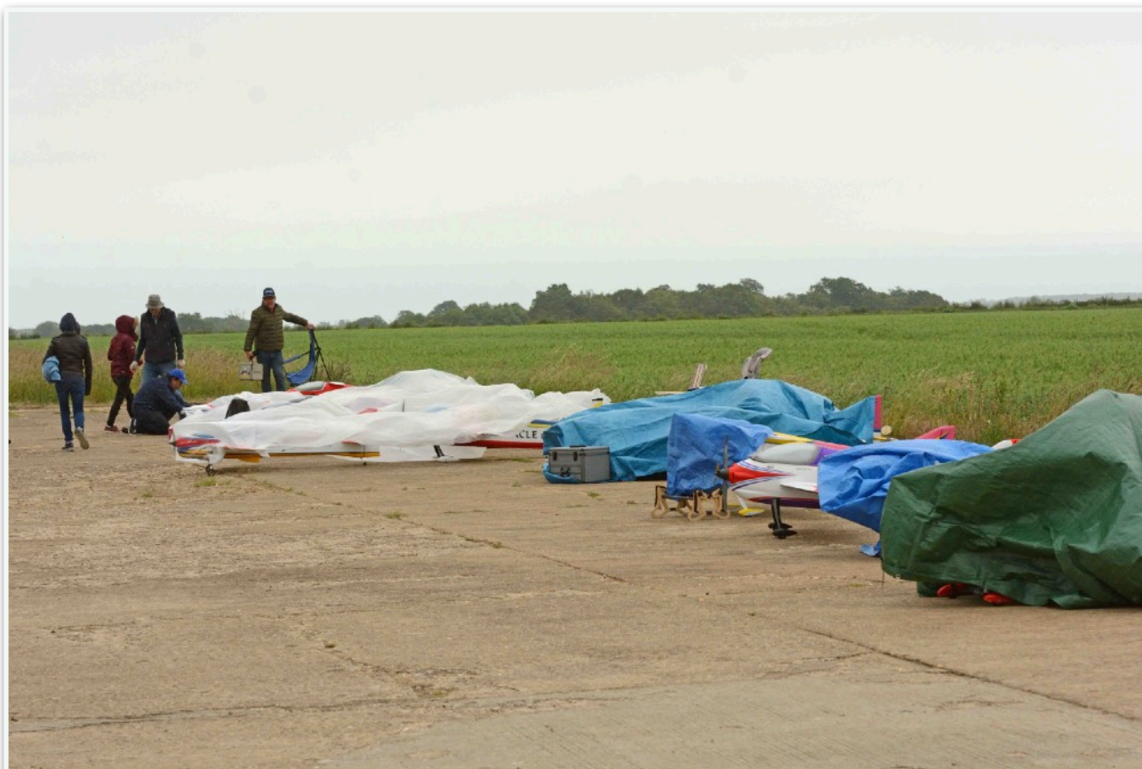
The coverup complete