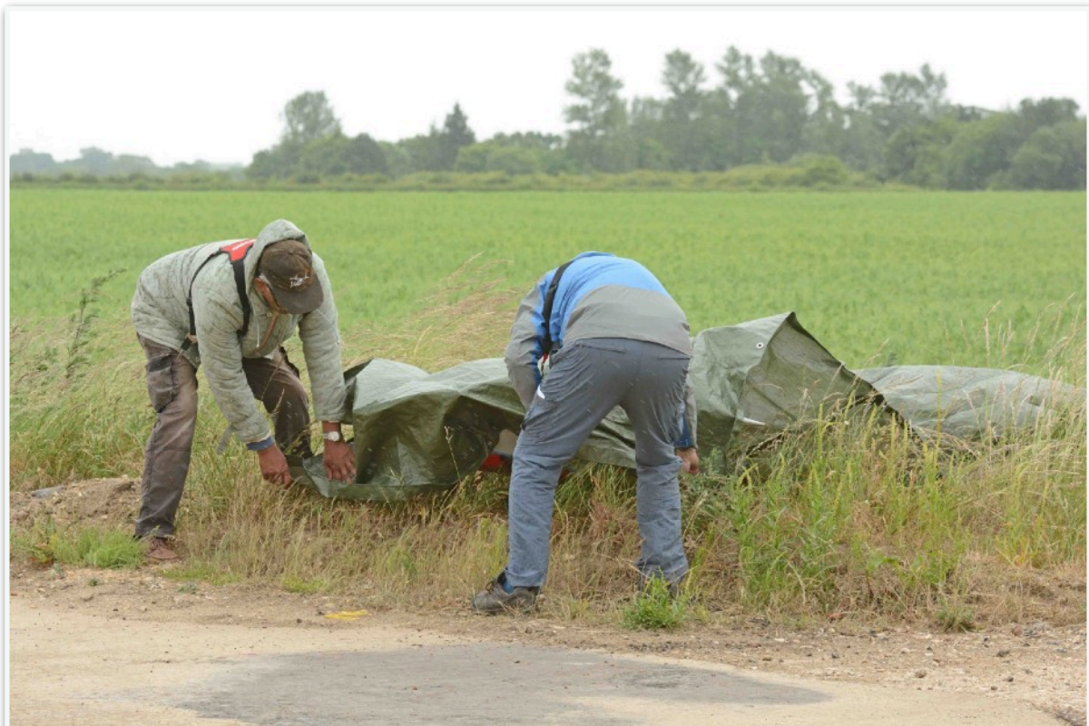
The rain cometh!