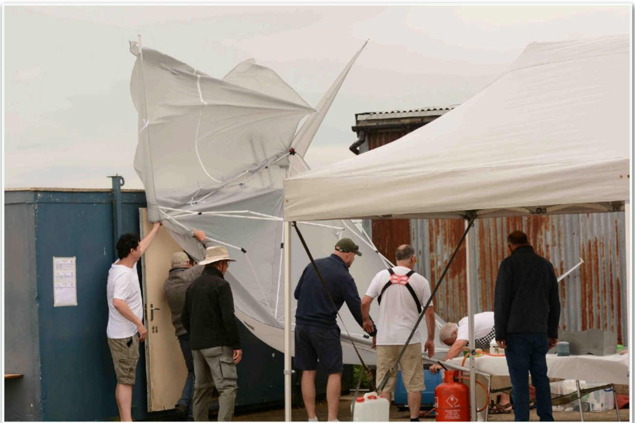
The Emergency with the Catering Gazebo!