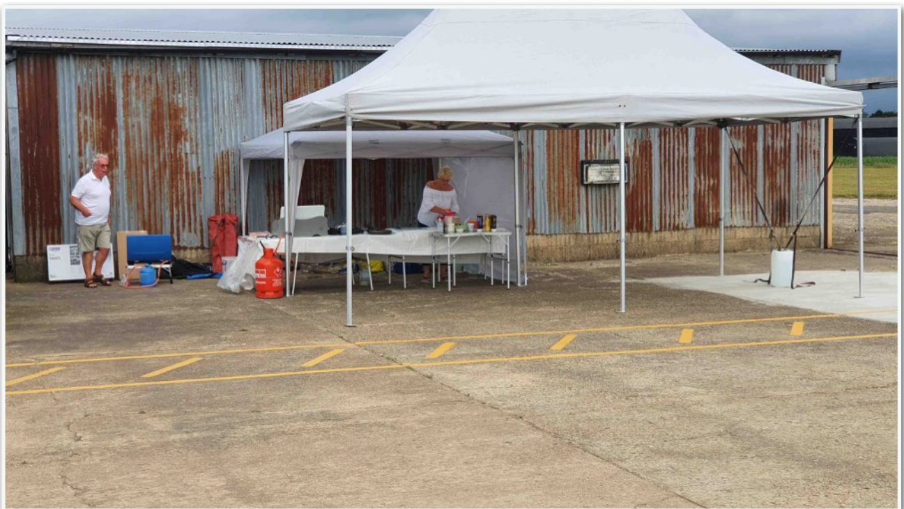
The Catering getting going